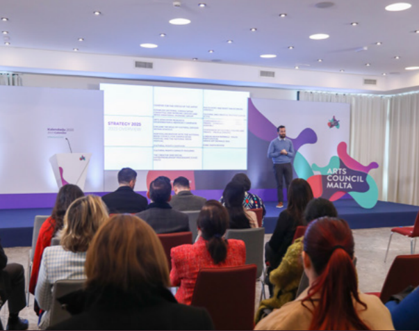
January Arts Council Malta's 2023 Calendar LEARN MORE