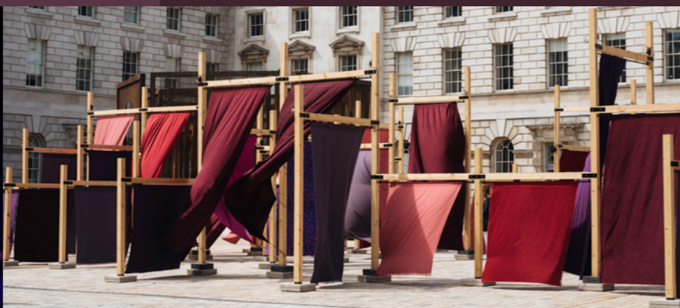
June First Malta Pavilion at London Design Biennale unveiled: Urban Fabric takes up prominent Central Courtyard space at Somerset House LEARN MORE