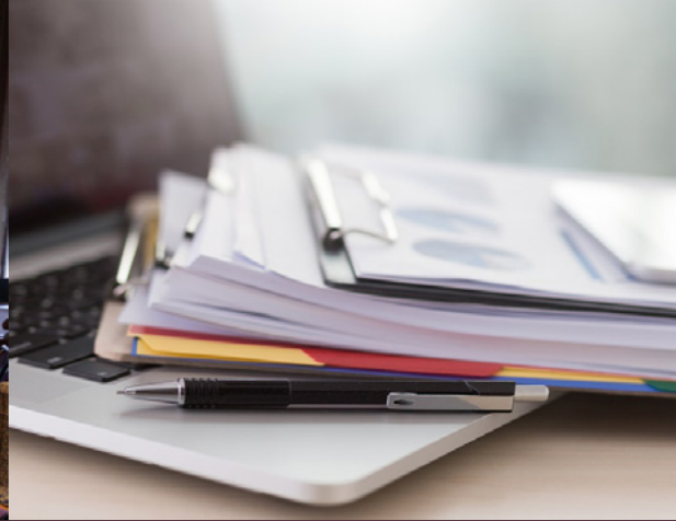
August Benefit from a reduced tax rate as a creative practitioner LEARN MORE