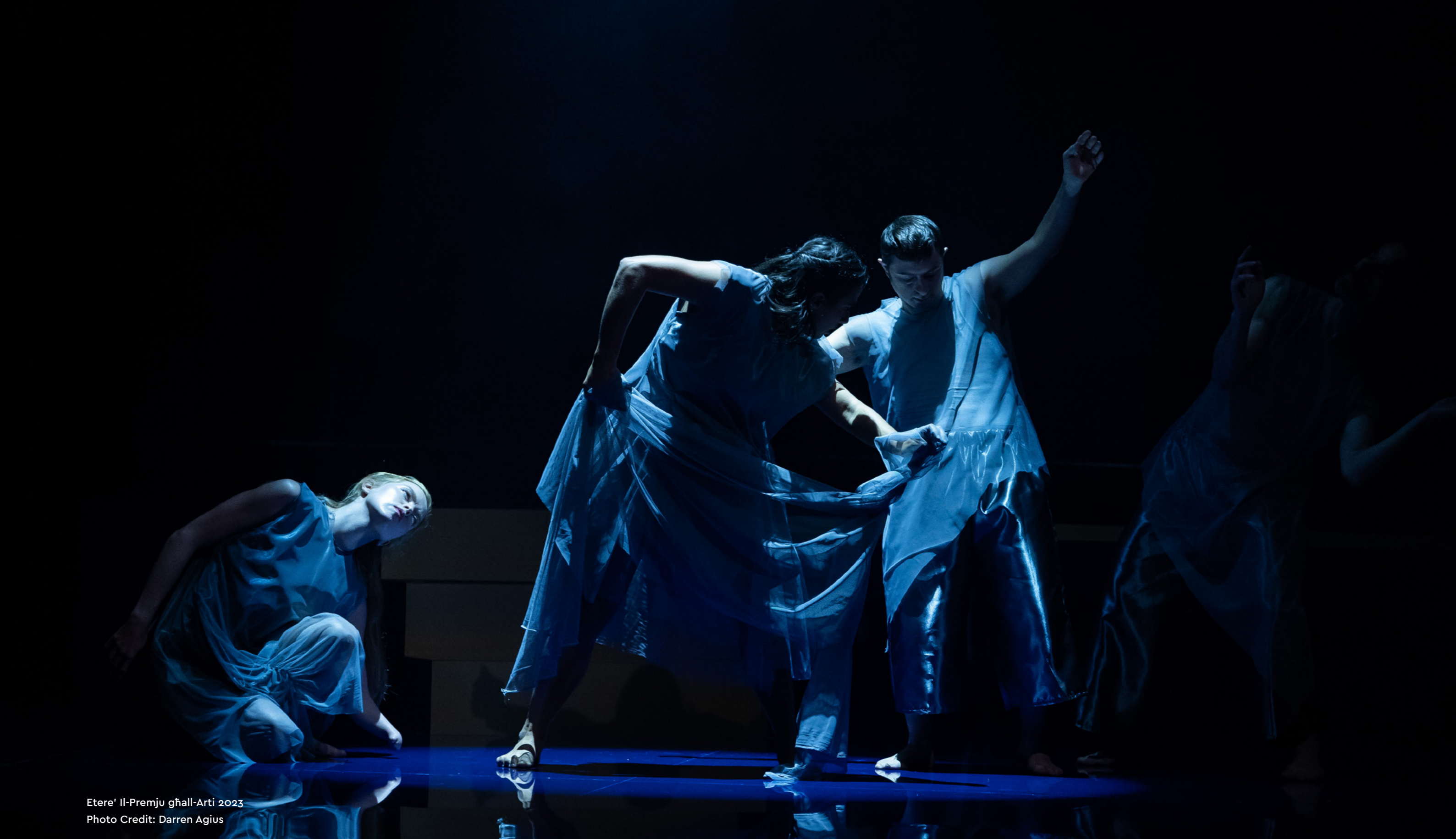
Etere' Il-Premju għall-Arti 2023