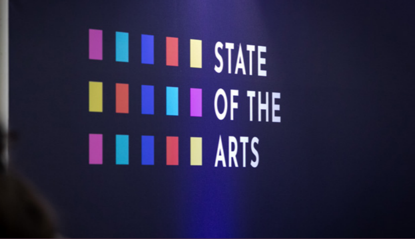
February Arts Council Malta analyses the outcomes from the first ever State of the Arts symposium LEARN MORE