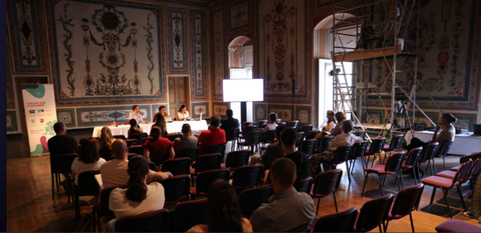
July ACM Funding Schemes & Opportunities LEARN MORE