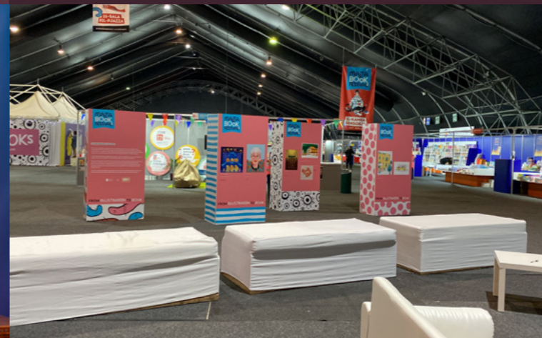
September The Malta Book Festival 2023 – Offering Varied Pathways Into The World Of Books LEARN MORE