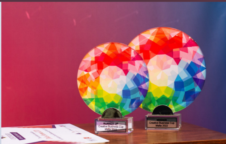
April Malta's Creative Business Cup launched for global 2023 competition LEARN MORE