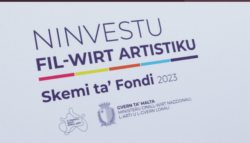
March Launch of half a million euros in funding schemes for feasts for 2023 LEARN MORE