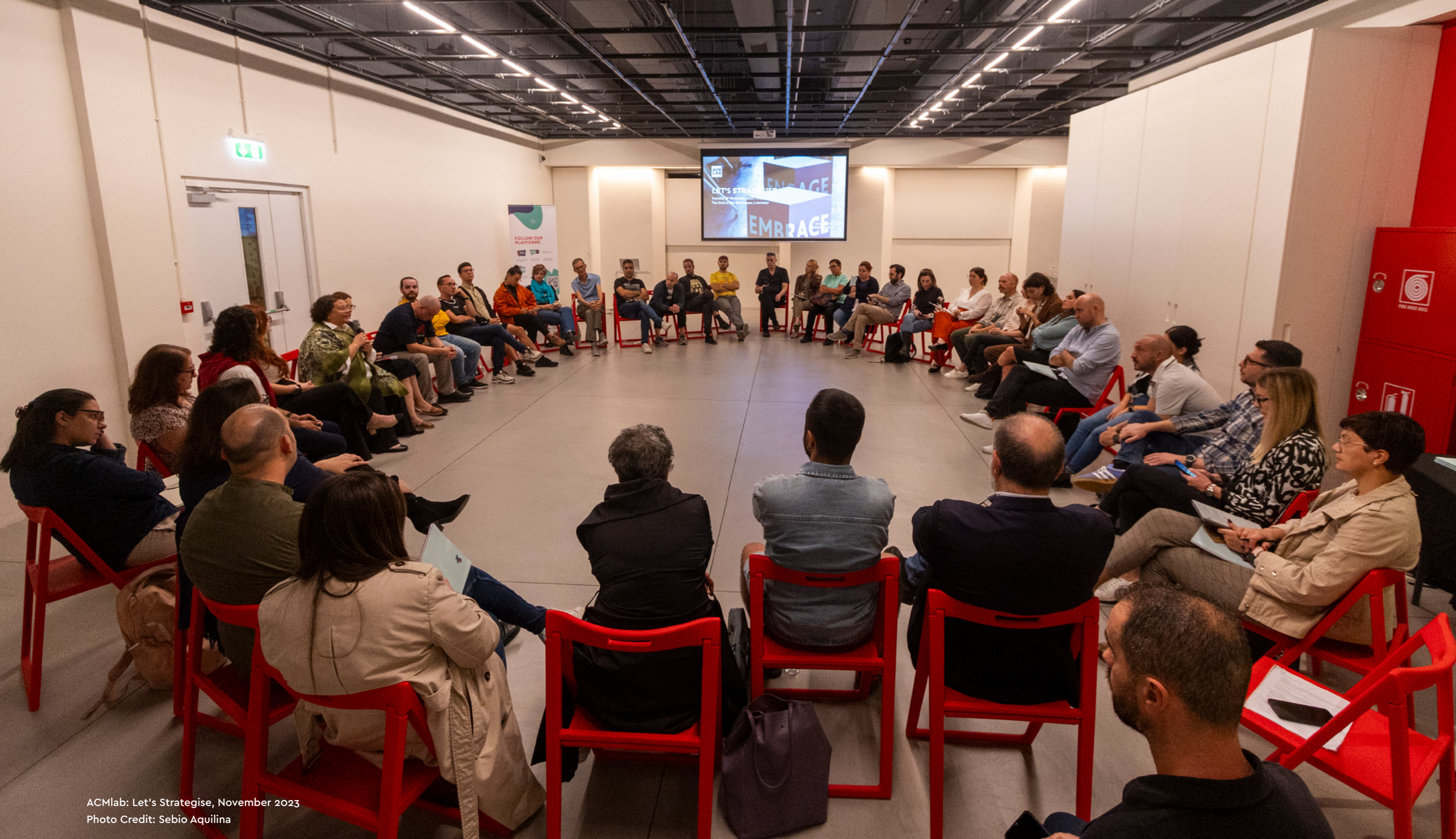
ACMLab: Let's Strategise, November 2023