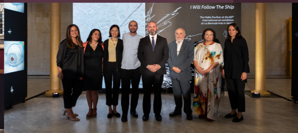
November Malta Pavilion at the Biennale Arte 2024 in Venice LEARN MORE