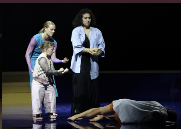
December 6 th edition of the Premju għall-Arti winners announced LEARN MORE