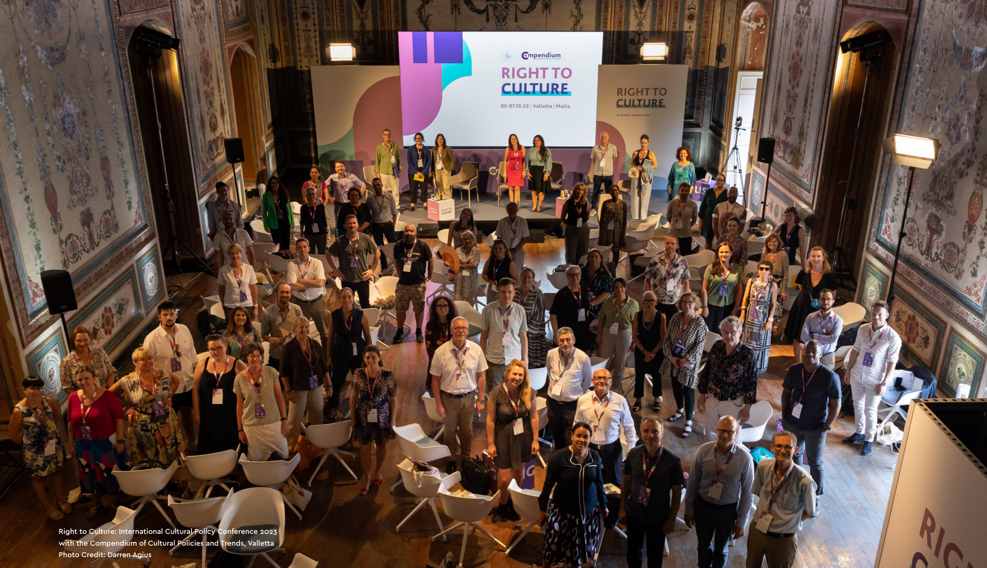
Right to Culture: International Cultural Policy Conference 2023 with the Compendium of Cultural Policies and Trends, Valletta